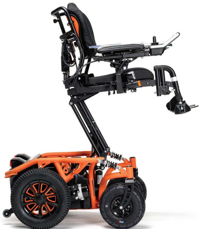
300mm seat lift included