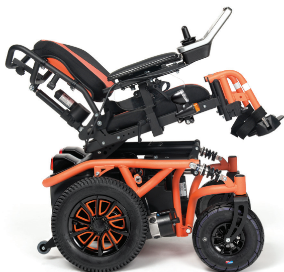
Electric-powered inclinable seat and backrest